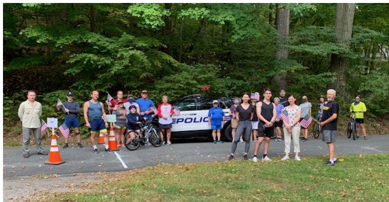
Village of Tuxedo Park Police Department Annual Report 2022

We also plan on increasing community policing and hold events such as Coffee with a Cop as well as other events to enhance interactions with the police officers and the community. We encourage the community to bring any ideas forward that you would like to see.