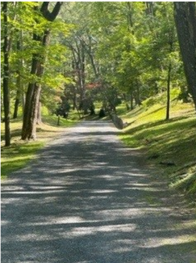
Fig 2: Driveway without Borders