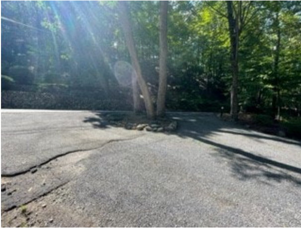
Fig 1: Apron adjacent to Lookout Road