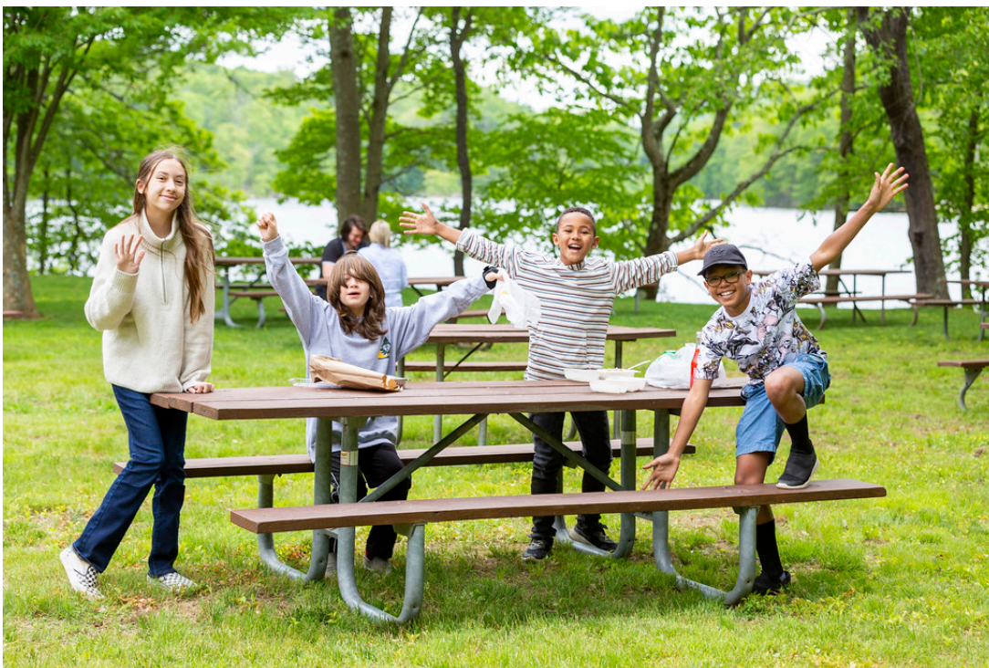
The Wee Wah Park & Beach Club Annual Party. Enjoyed by all, especially the children!