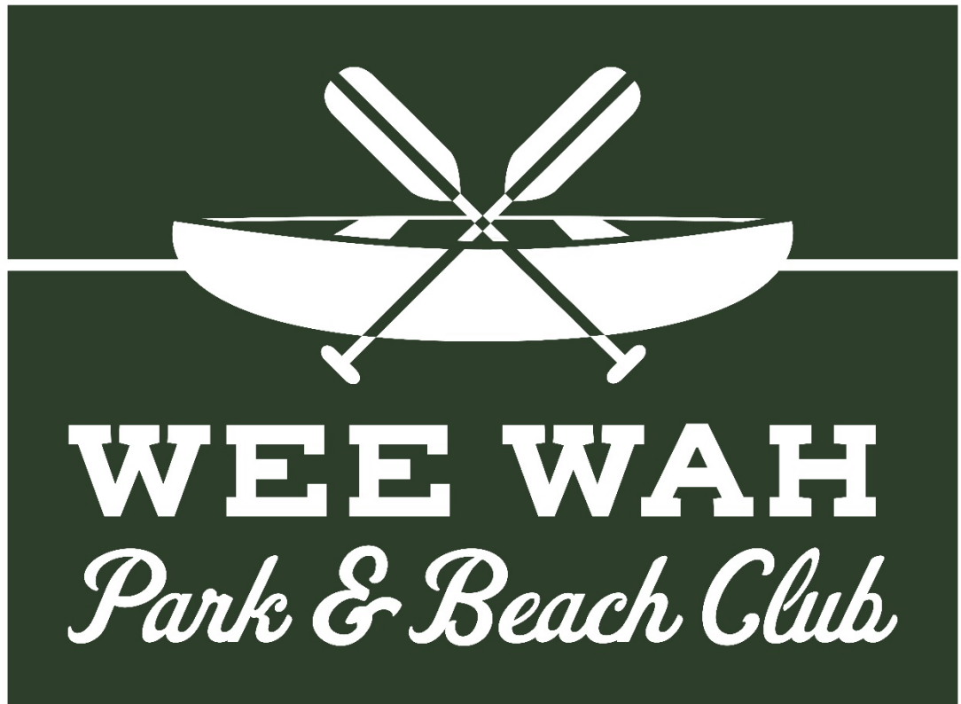
Wee Wah Park & Beach Club logo © copyright protected