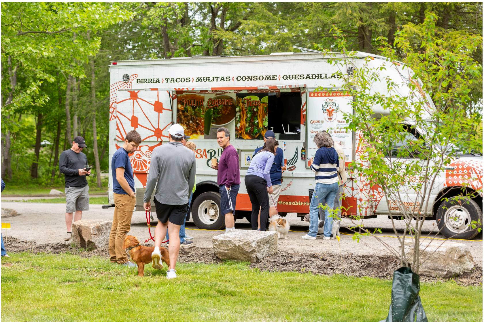
Casa Barria NYC food truck serves chef-prepared Mexican delicacies at the annual party May 21st.