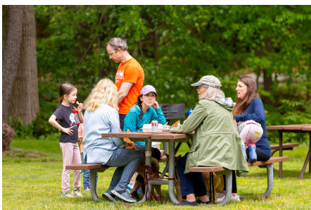
The Wee Wah Park & Beach Club Annual Party took place on Sunday, May 21, 2023. All had a good time!